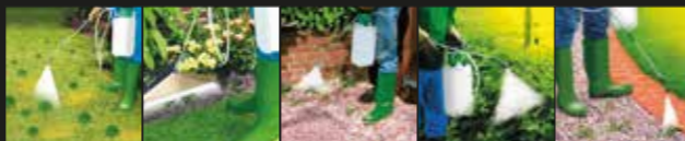
Weeding near roses, trees and ornamentals with pressure sprayer | Clear weeds around walls, fences, trees and shrubs | Renovate overgrown areas | Destruction of lawn | Clear weeds from drives and patios

Poisons information: For information or to report a poisoning incident in Ireland, contact the National Poisons Information Centre (01 809 2166), retain the label for reference.