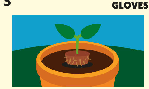
Tap out the plant from the old pot, loosen the root ball and place in the centre of the pot.