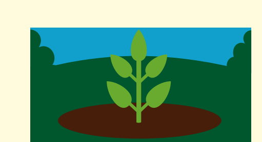
Position the plant and fill with 50% soil and 50% compost and firm around the base.